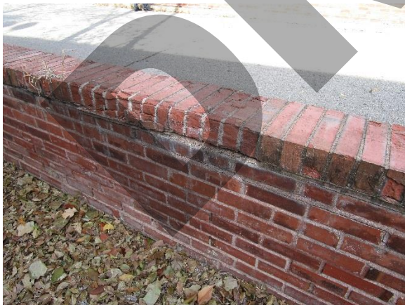
Repair or replace substantially damaged bricks and tuck point wall as needed