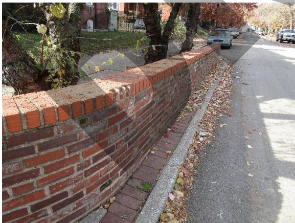
Replace any substantially damaged bricks