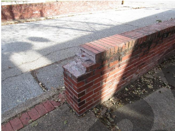
Replace/repair missing bricks on rear section