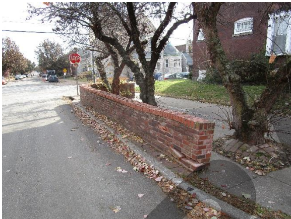
Rebuild damaged rear section of wall