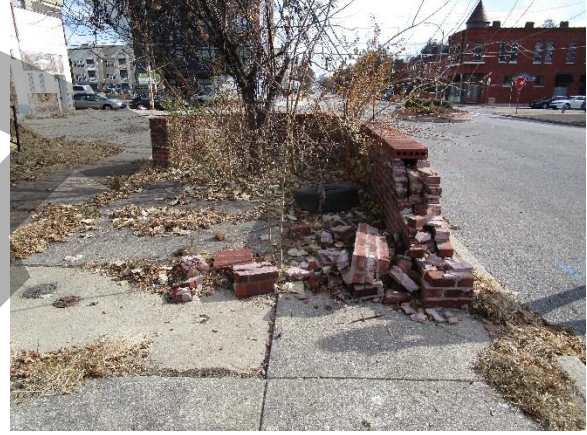
Rebuild rear section of wall