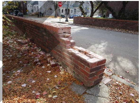
Rebuild damaged rear section of wall