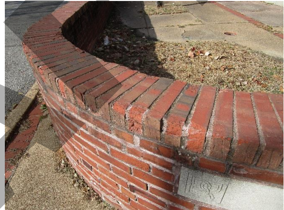
Spot repair substantially damaged bricks as needed