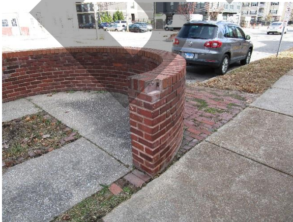
Match and replace missing bricks