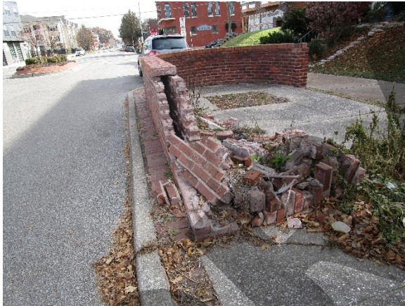
Rebuild rear section of wall